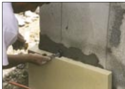
Fixing the tie with a screw