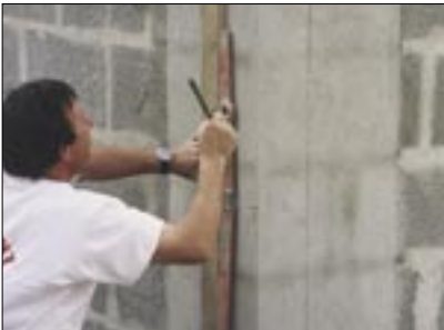
Drawing the vertical alignment