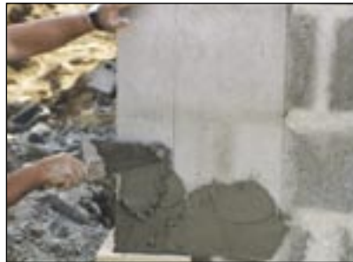
Putting fixing mortar on the wall