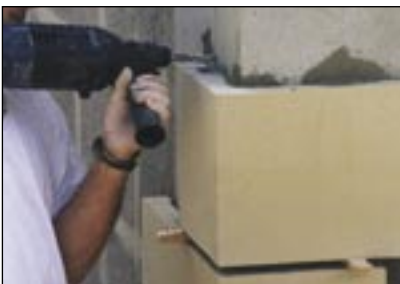
Drilling a hole for the rawlplug