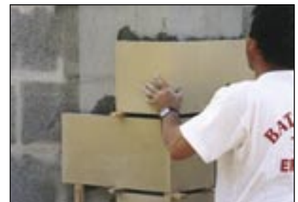
Laying the quoins on one another