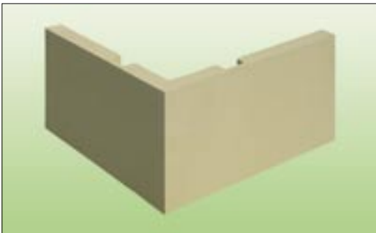
39 x 39 quoin

Weser quoin cladding enables you to enhance your façades and give them the traditional aspect of older houses. Depending on the style you wish to adopt, the cladding can be staggered, or laid straight.