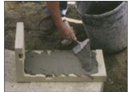
Putting fixing mortar on the quoin